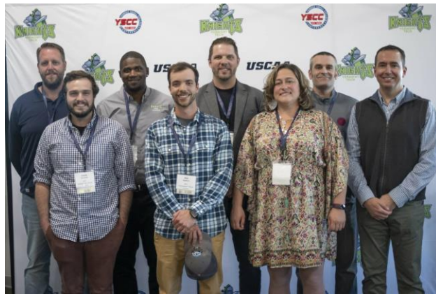
2 - VTC Athletic Hall of Fame event