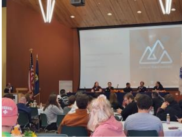
2 - November 5, 2022 Lyndon Campus Open House