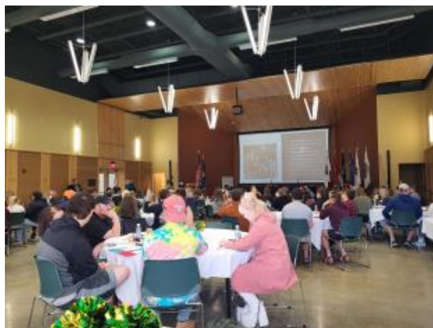
1 - November 5, 2022 Lyndon Campus Open House