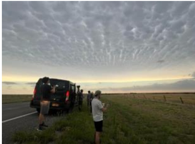
7 - Storm Chasing from Rutland Herald