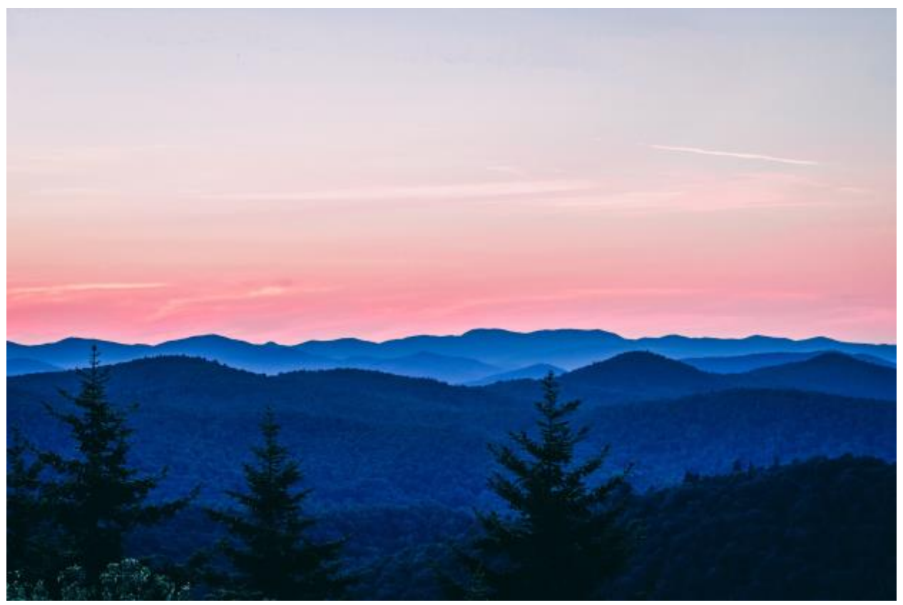
VSCS Transformation Newsletter (9/12/22)