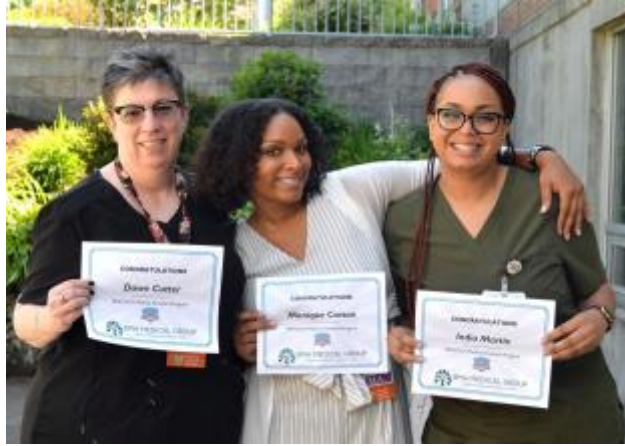
1 - Congrats to BMH/CCV Graduates!